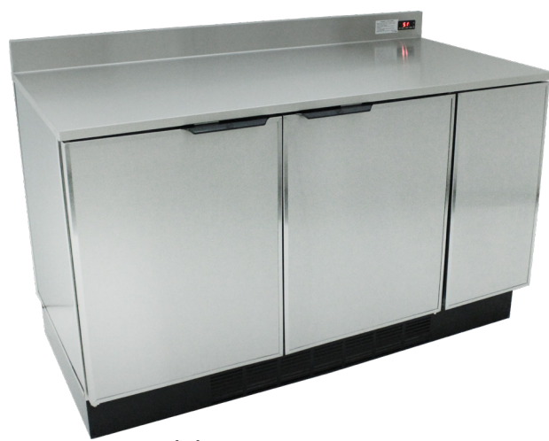
Model - RBC-60-DOE-120V