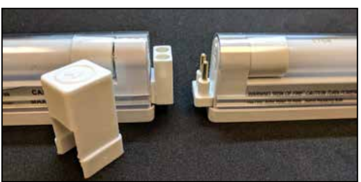
Step 4 - Reconnect the new lights

Using the connectors reconnect the new lights. NOTE : One (1) connector comes with kit.