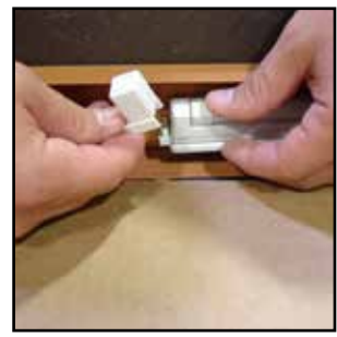
Step 3 - Removal of old light

Remove the light fixture by grasping both ends and tilt the fixture down in clips and pull out of two metal or plastic spring clips.