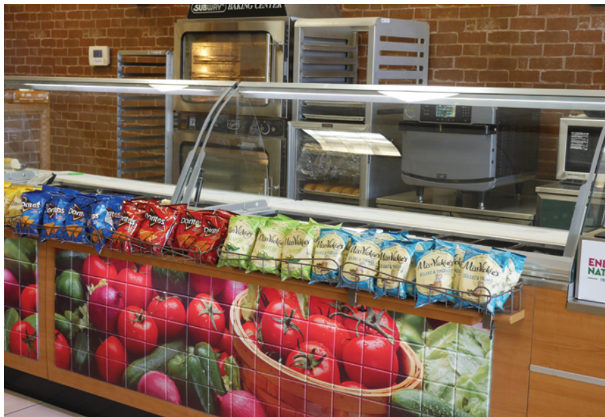
After (New Clear View Day Cover)