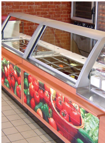
Before (Old Day Cover)